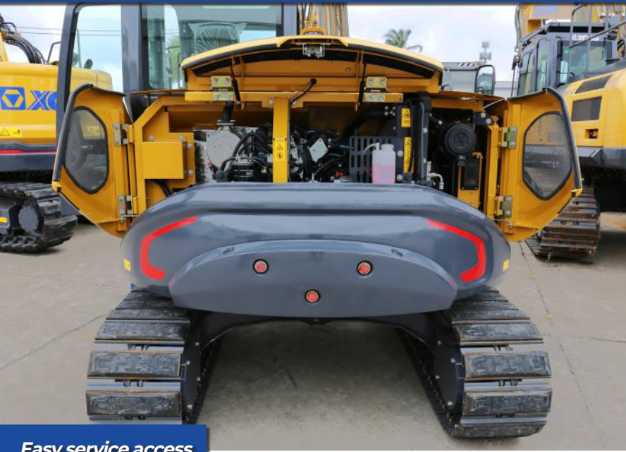
Easy service access to all componentry