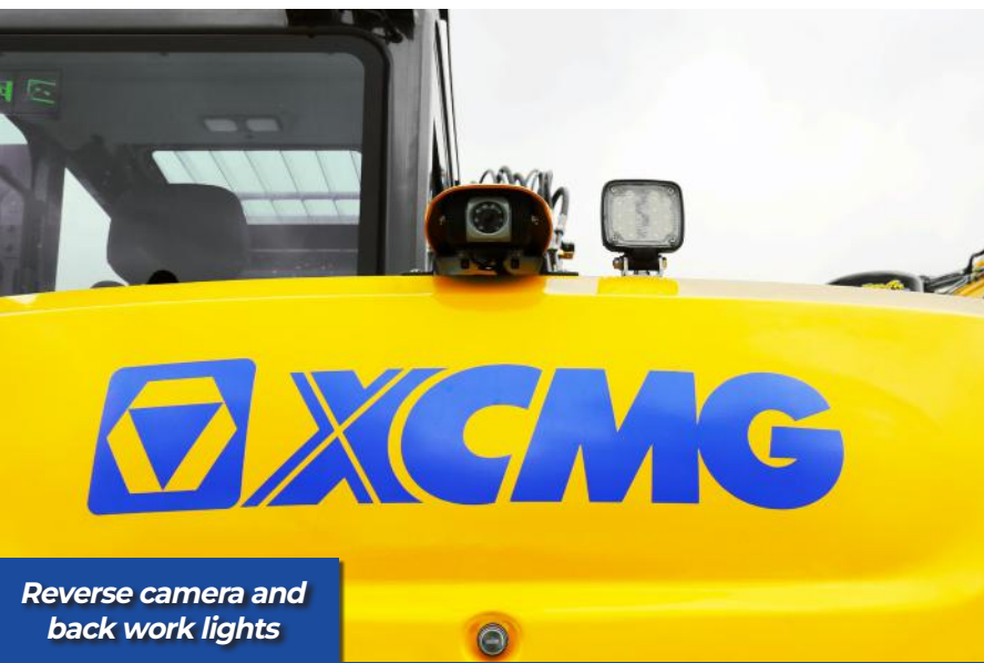
Reverse camera and back work lights