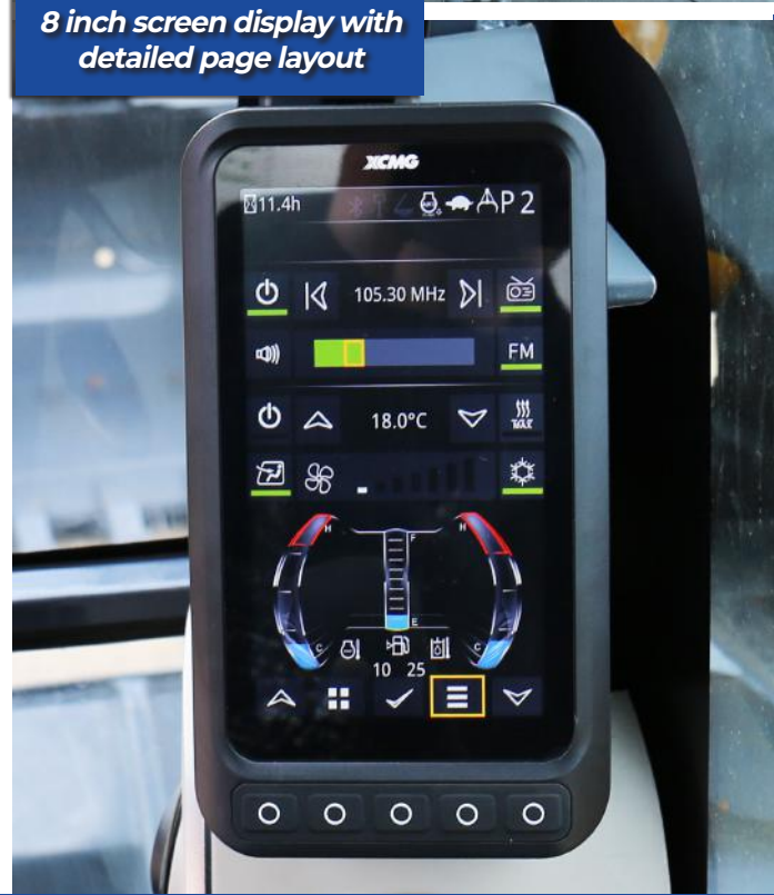
8 inch screen display with detailed page layout