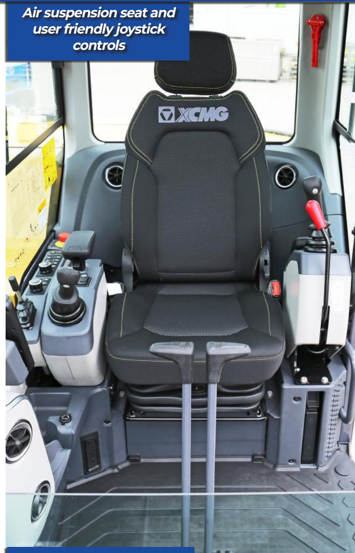
Air suspension seat and user friendly joystick controls